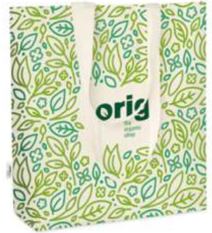
MB8104 Cotton bag with 10cm bottom and long handles (38x10x42cm).