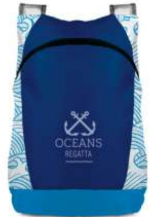
MB1006 Foldable backpack.