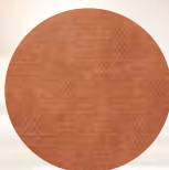
Non Woven with lamination