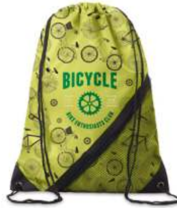
MB3003 Backpack with zipper and mesh pocket.