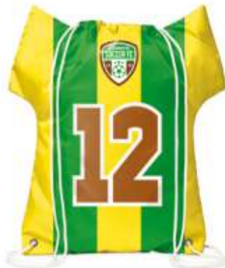
MB3004 Drawstring bag in T-shirt shape.