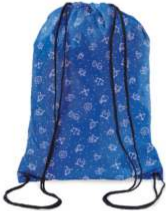
MB3006 Large drawstring bag.