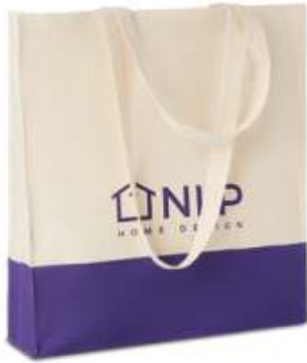
MB8103 Cotton bag with gusset and long handles (38x10x42cm) Long handle 70 x 2.5 cm.