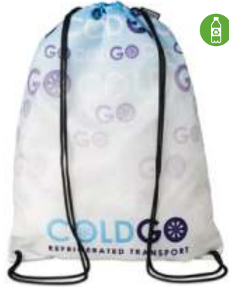
MB3106 Large 100% RPET drawstring bag.