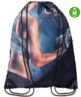
MB3103 100% RPET drawstring bag with zippered polyester mesh pocket