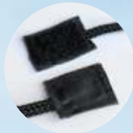
Optional safety closure