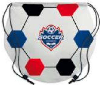
MB3010 Football drawstring bag.