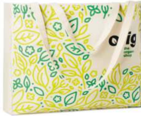
MB8106 Cotton bag with gusset and long handles (50x15x40cm).