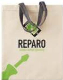
MB8109 Small cotton bag with short handles (26x32,5cm).