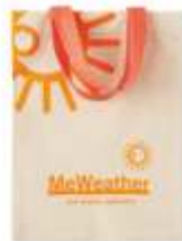
MB8108 Small cotton bag with short handles (19x25cm).