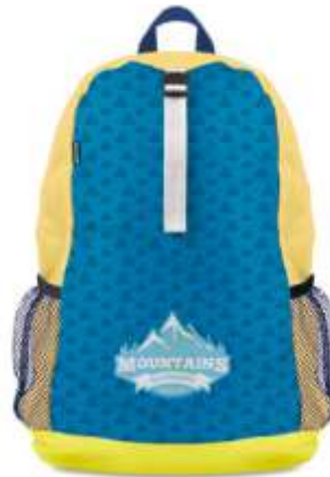
MB1005 Foldable backpack.